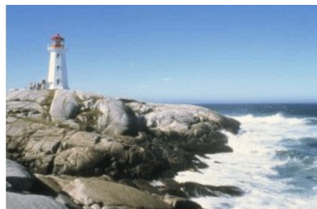
Halifax, Nova Scotia—the site of one of the new semester programs