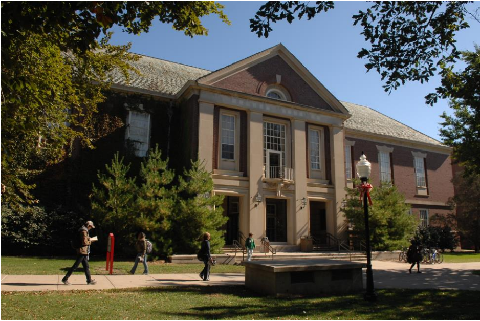
Illinois State University – Williams Hall Home of Management Development International